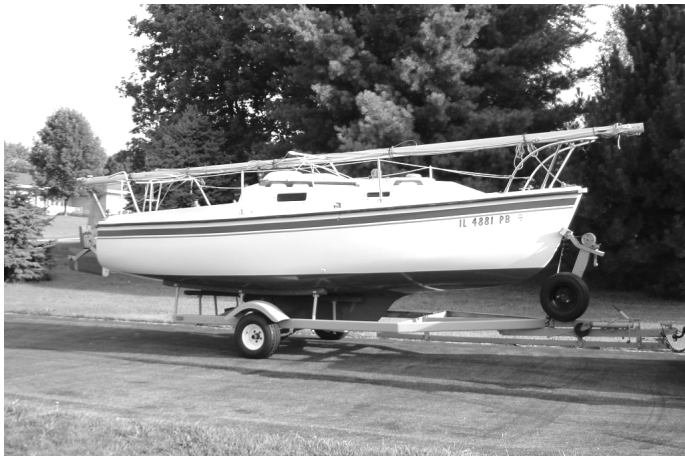
The finished product.

After cleaning the grass and mud off of the hull, the painting was completed and the boat was returned to its cradled position on the trailer. Every "Captain Ron" moment should expand our knowledge and teach us a lesson. I definitely learned that whether you are sailing your boat on water or land, Mother Nature and how you plan for her unpredictable behavior, will play a large role in the success of your adventure.