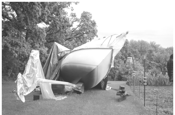
The importance of weight distribution!

As heart-wrenching as it was to hear those words, the boat did indeed fall over. I jumped out of bed, grabbed a flashlight, and headed for the door. Judy provided sound advice as she left for work. "Don't do anything stupid!" A cursory look around the boat quickly revealed what happened. Although rain drops are individually "gentle", when they collect in a low spot on a tarp, they have strength in numbers. The weight of the pooled water pulled out the stakes that were holding the tarp to the ground. The newly formed swimming pool fell into the cockpit and moved the center of gravity quickly to the stern of the boat. The bow of the boat raised into the air allowing the keel to slide backwards off of the blocks. Similar to what is desired at a steep boat ramp, the boat launched itself stern first into the soft sod. The "spider legs" no longer were making contact with the ground which allowed the boat to roll over on its side, snapping the port leg off under the weight. You've seen the post-hurricane pictures. Very similar.